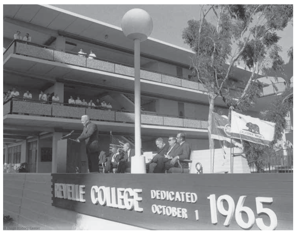
UCSD's first undergraduate college, Revelle College, was founded in 1965 and named in honor of the chief architect of the university.

At a Regents meeting in November 1960, President Kerr recommended that the name of the campus be changed from the "University of California at La Jolla" to the "University of California at San Diego," which was approved. The date of the Regents' action was November 18, 1960. In the early 1980s the decision was made to designate that date as the official "Founders Day" for UCSD. We had a wonderful twenty-fifth Anniversary Celebration on that date in 1985, and in 2010 the campus celebrated its fiftieth Anniversary year.<sup>6</sup>