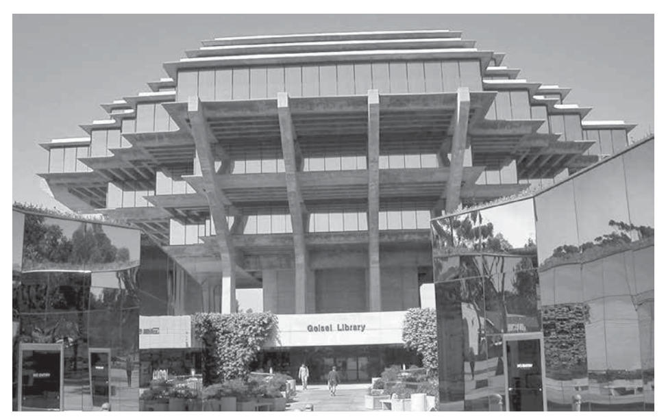
The Geisel Library (1970), designed by William Pereira & Associates, remains a distinctive feature of UCSD's campus.