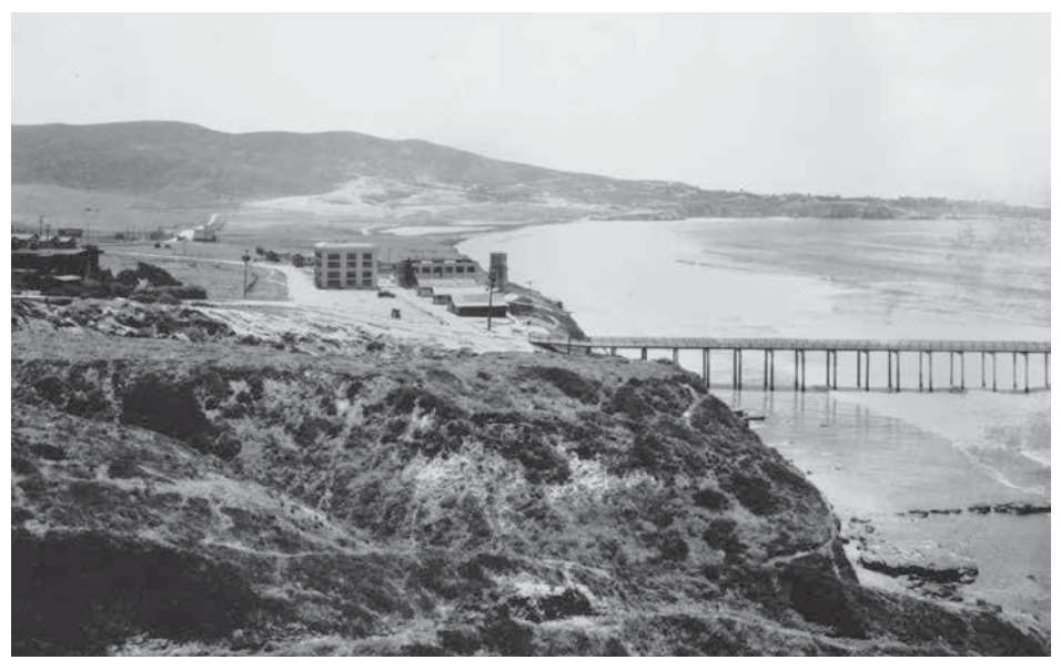
By the 1920s, SIO had a laboratory, a public aquarium, a pier, a library and museum building, and nearly two dozen cottages where faculty and staff lived and worked.

That building, the George H. Scripps Laboratory (1910), is still there today.